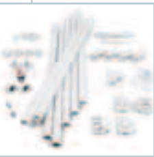
Installation kit (2 inlet valves)